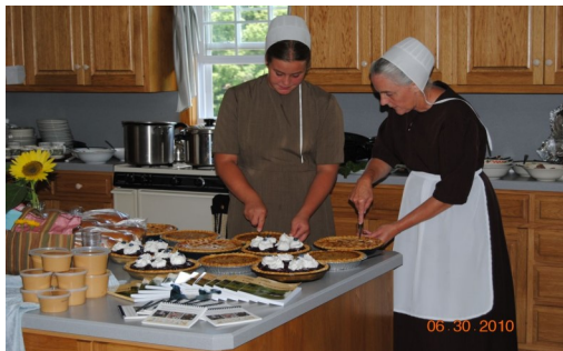
Dinner in an Amish Home